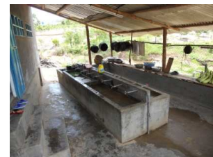
Kitchen washing up area