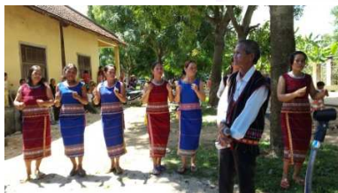
Village Montagnards welcome us