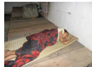
Sleeping rough VS4