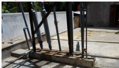
More of the well system incl sand filter