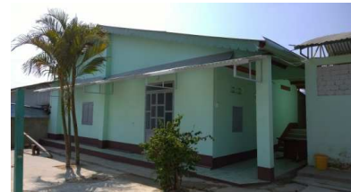
The refurbished dorm from the outside