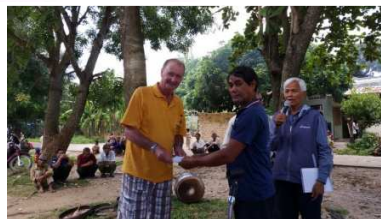
Village Chief passes me Certificate of Thanks