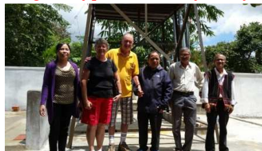
The official group photo