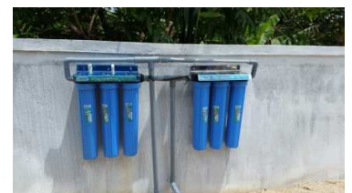
Part of the filter system for the well