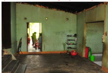
Before – the dining area. Dark and gloomy