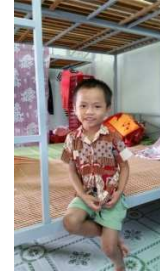
5 year old Phuoc VS4