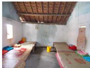
Sleeping benches for kids