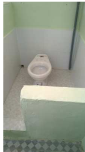
Part of new toilet area