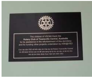
Rotary Central Plaque

The dining room is great but there is still work to be done to complete the kitchen. The refurbished dormitory is 100% on what it was. VS4 kids are in good health and happy. Most were on school vacation when we were there. They work like USA so most children must return to their villages. None of this could happen without the great financial support of our Rotary Clubs, RSL and other supporters. You are putting smiles on little faces. Well done.