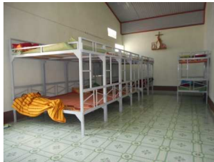
After – the new sleeping arrangements