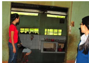
More of the same