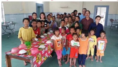
After – The kids now have a happy place to dine 110% on what it was before.